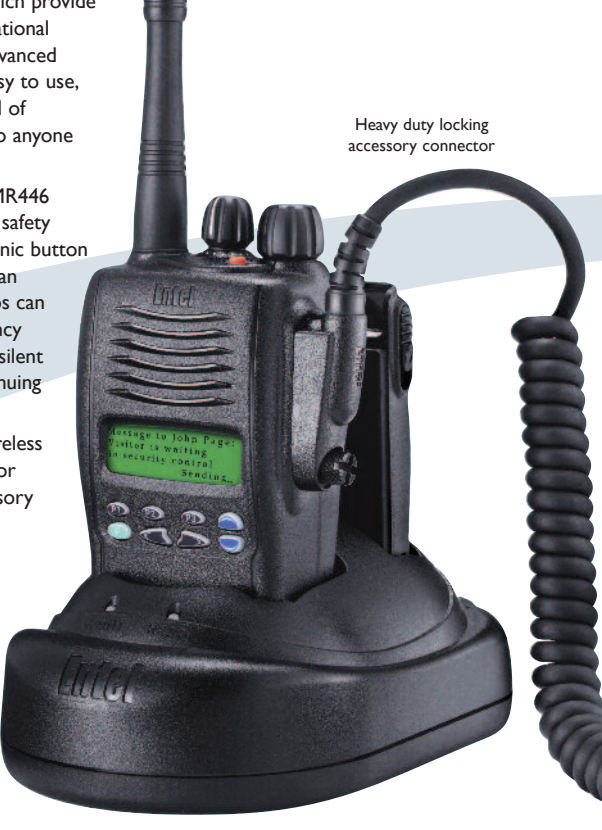
Pictured: Radio with optional stubby antenna and dual slot CSAHX rapid charger

Bluetooth (option) – for convenience, wireless transmit is available on all models, allowing for connection of Entel's Bluetooth audio accessory range, as well as data transmission devices.